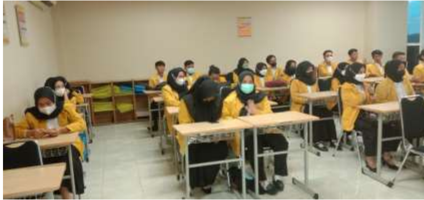
Figure 2. Presentation of Material for the Preparation of Simple Financial Statements

implementation of community service activities in this activity, the implementing team makes preparations for the implementation of activities starting from discussing the material that will be presented to partners. The ability of partners to manage finances is very necessary so that the business implementation process can run effectively. Cash and inventory records are carried out so that the finances of business activities can be monitored properly. The recording is very necessary in business activities at least to be able to see how much profit or loss from a period in the business it does.