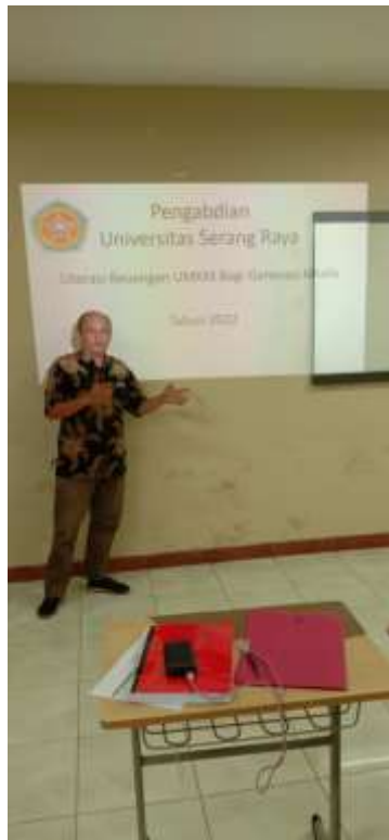
Figure 1. Opening of the Training by the Service Team