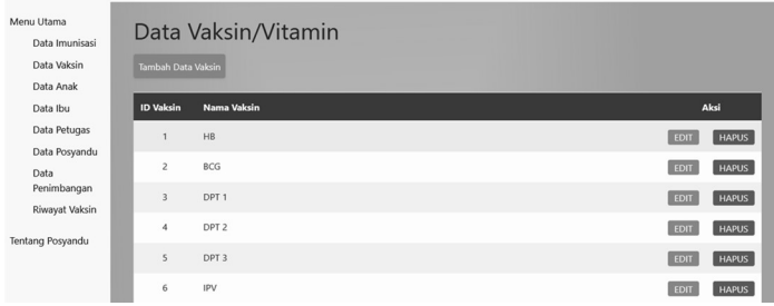
Figure 4. Vaccine Data Page