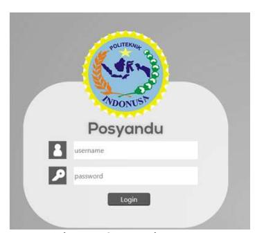
Figure 2. Login Page

The login page is used by admins and posyandu officers to enter the system, and admins or officers can carry out activities in the system.