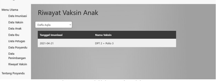
Figure 5. Child vaccine history

On the Child Vaccine History page, information regarding child vaccine data can be seen. This page makes it easier for officers to track the history of the child having received any vaccines. The child vaccine history page is shown in the figure 5.