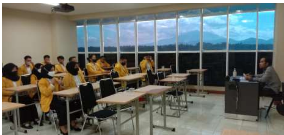
Figure 2. Presentation of Material for the Preparation of Simple Financial Statements