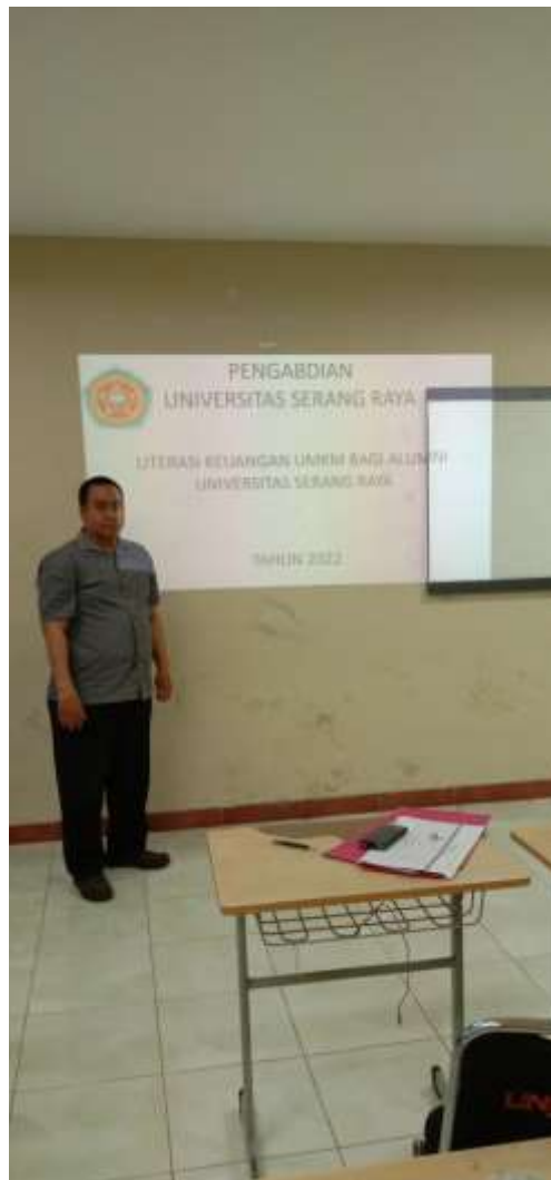
Figure 1. Opening of the Training by the Service Team